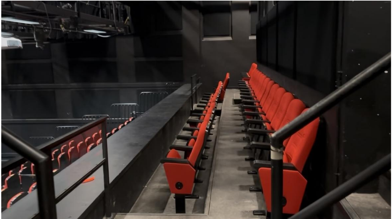
Image Description: Red theatre chairs in two rows. The front row goes two steps down. A black railing is in front of the front row of the seats. Stairs to the tech booth are seen on the right.