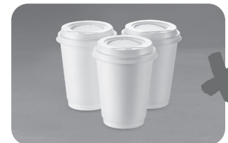
Take out beverage cups