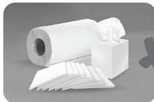
Paper towels, tissues, and napkins