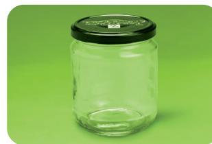
Glass bottles and jars: Clear and coloured jars and bottles