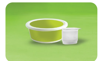
Plastic Containers: Plastic bottles and jars, laundry jugs, and yogurt tubs