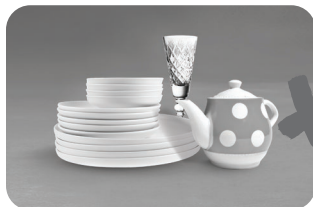
Dishes and ceramics