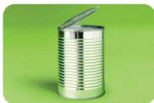
Steel food and beverage containers: Soup cans and pet food tins