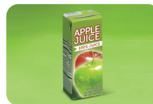
Cartons: Milk cartons, juice boxes, and soup cartons