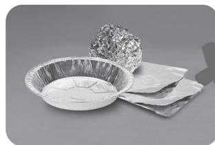
Aluminum foil, pie plates, and trays