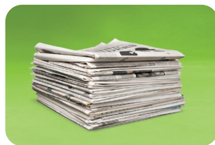
Printed Paper: Newspapers, magazines, flyers, and home office paper

These are some examples of types of recyclable materials accepted in your recycling program: