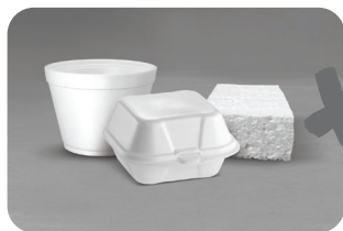
Foam packaging of any kind