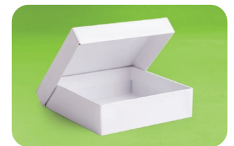
Cardboard and boxboard: Cereal boxes, cardboard boxes, and cardboard tubes