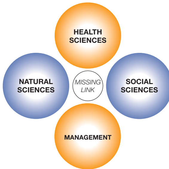
Diagram 1 Missing Linkages Between Fields (Four Spheres)

As part of its mandate, the Commission conducted a basic diagnosis of the current state of sustainable development training and practice. Under the guidance of the Commission's six Regional Coordinators, the Commission launched a series of consultations, engaging a cross-section of practitioners from universities, government and non-government agencies, financial institutions, and other development-focused organizations in Africa, East Asia, Europe, Latin America, North America and South Asia. Consultations included interviews, regional conferences, surveys and questionnaires. Throughout the consultation process, Commissioners identified shortfalls in cross-disciplinary problem solving and the lack of systematic skill-development across a range of core competencies within both professional education programs and organizations working in sustainable development.