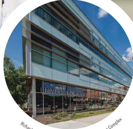
Richardson College for the Environment and Science Complex