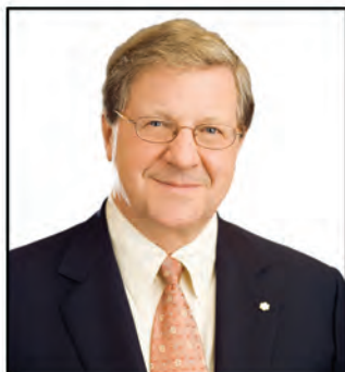
Dr. Lloyd Axworthy President & Vice-Chancellor The University of Winnipeg Director, The University of Winnipeg Foundation Board