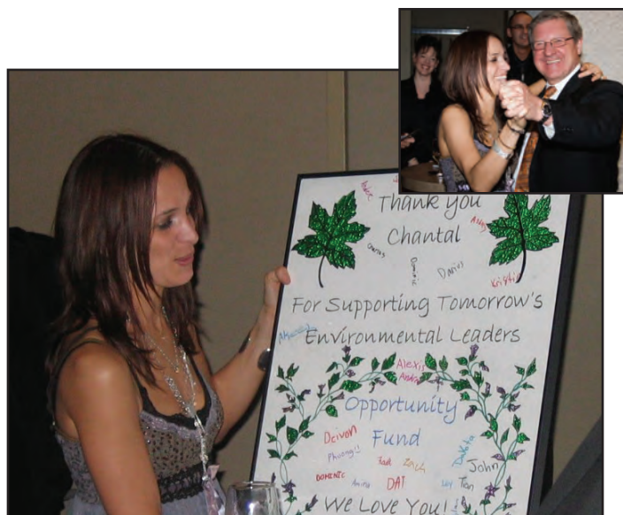
Chantal Kreviazuk accepting student "thank you" presentation at concert reception February 19, 2007

Through The University of Winnipeg Campaign initiative alongside donor support, our goal is to build the Opportunity Fund endowment to $10 million.