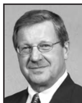
Dr. Lloyd Axworthy, PC, OC, OM President and Vice-Chancellor United College BA '61, LLD '86 2004 – Present