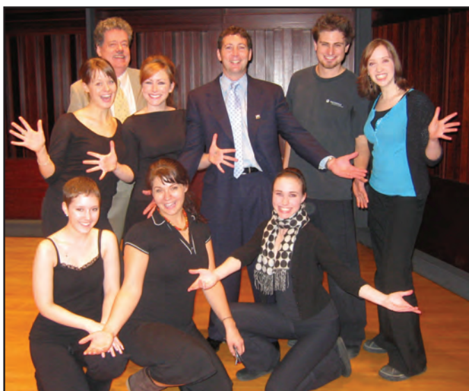
UWinnipeg students perform Age of Aquarius to full house at December 12, 2006 CanWest announcement.

"We rely on their skills to help our company grow. Support for performing arts and post secondary education are two of CanWest's priority areas of community support."