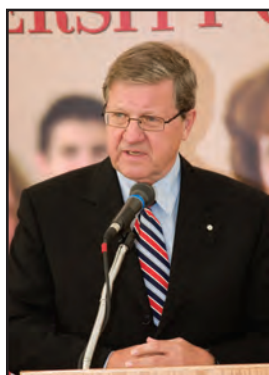
University President Lloyd Axworthy