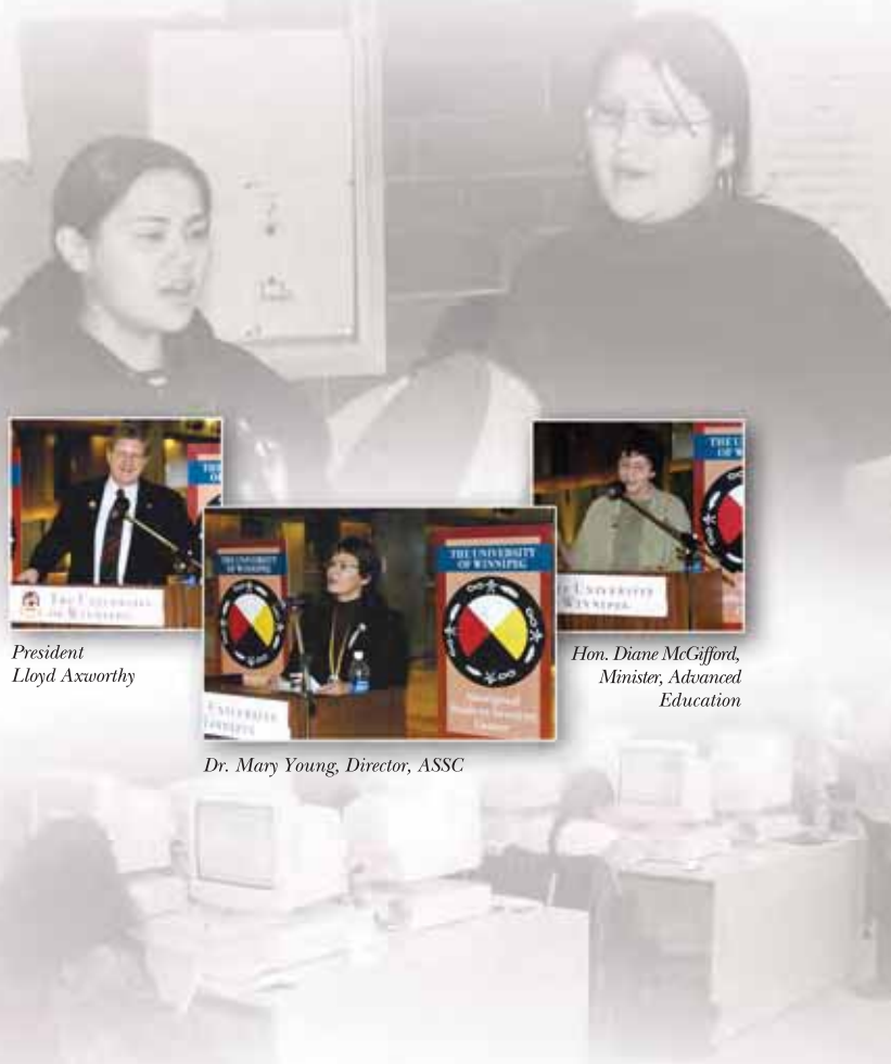
President Lloyd Axworthy

In addition to providing study and meeting areas, the new centre is the University's focal point for culturally relevant Aboriginal programming, including interactions with Elders, healing circles, and programs that encourage students to celebrate their identity. The Centre's students benefit from student bursaries of $100,000 established by Great-West Life.