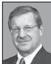
Dr. Lloyd Axworthy, PC, OC, OM President and Vice-Chancellor The University of Winnipeg 2004 – Present