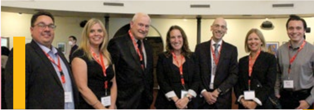
Members of the Collegiate Alumni Association Board of Directors celebrating the Association launch on September 14, 2022.

Note: The establishment of the Association completes the work of the Committee.