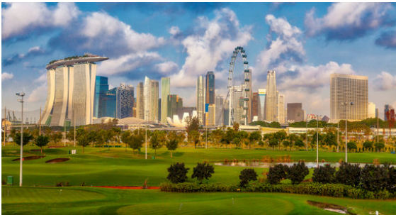
Innovative Solutions for Creating Sustainable Cities