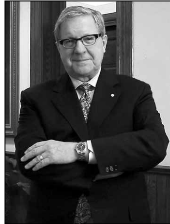
Lloyd Axworthy, PC, BA, PhD, LLD, OC, OM

I encourage you to remain in touch and engaged with the University community. On behalf of our faculty and staff, congratulations and please accept our best wishes for your future endeavours.