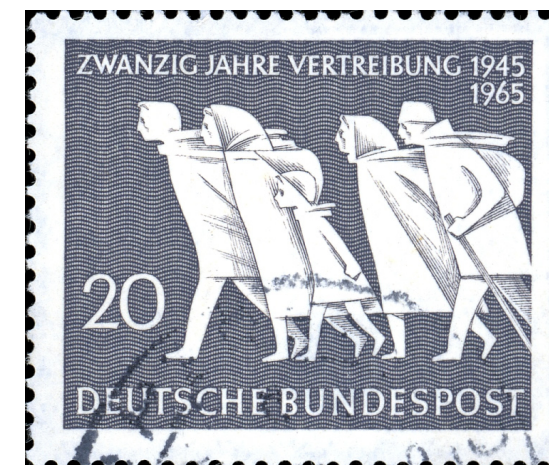
West German commemorative stamp 'Twenty Years Expulsion 1945 1965'

German-Canadian Studies http://germancanadian.uwinnipeg.ca