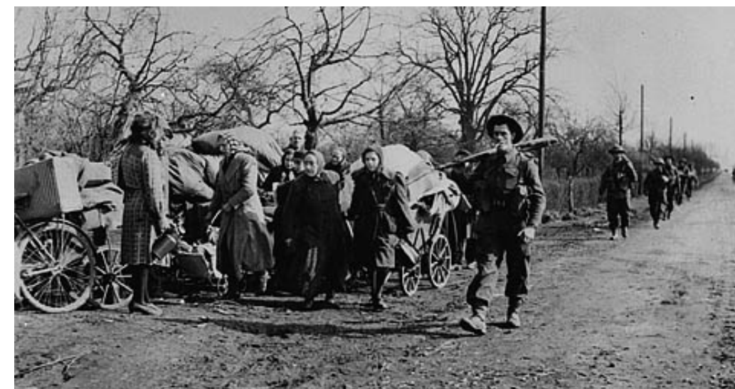
Canadian infantrymen passing German refugees, Xanten, Germany, 9 March 1945